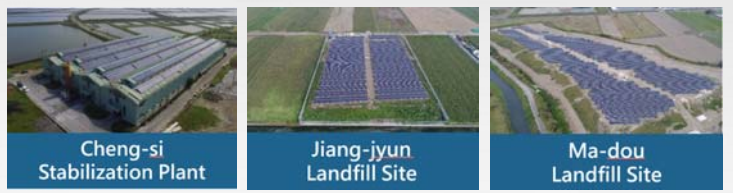
Cheng-si Stabilization Plant Jiang-juun Landfill Site Ma-dou Landfill Site

During the past eight years, we have approved a total of 4,650 applications with an installed capacity of over 445MW, generating nearly 576 million KWH of electricity annually. It represents 3 hundred thousand tons of carbon reduction, equal to the CO2 absorption of 937 Tainan Parks. Our mid-term target is to achieve 1GW of installed capacity from solar energy by 2021, so that we can fulfill the target of 20% electricity from renewables by 2025.