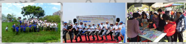
「CSR Happy Alliance」 「Yenshui River Happy Platform」 「Environmental education promotion」