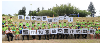
National first carbon neutral and zero-carbon campus

Yuan An Elementary, Houbi District, Tainan City School was certified to pass the completion of carbon neutral by third party in 2015.